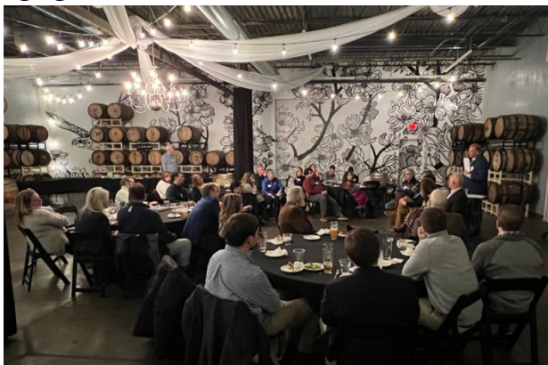
On January 23 rd at Triple Crossing Brewing Company in Richmond, 40+ people attended our 1Q

I hope all is well and your 2025 is off to a great start. It is an honor to serve you and the VCCAI this year as President. I have been a Chapter Member since 2014 when I came into the profession as a novice appraiser. Quality education offered by the Appraisal Institute will always remain at the forefront and prioritized as the “why” of our organization. Yet, the connection to other “like-minded” professionals and leaders within our industry, at the chapter level (and beyond), is equally as important. How do we grow as a professional without the sharing of ideas, and the professional relationships we develop? We have started a new Member Highlight series in 2025, bringing to light the exceptional members we have here in the Commonwealth. We will continue to do this throughout the year, and I hope you will enjoy getting to know a little bit about your fellow members you may have not had the pleasure of meeting yet. The last question in the spotlight is “What is the biggest benefit you’ve seen from your involvement in the VCCAI?”. The resounding answer to this question thus far has been the people and the professional relationships that have grown from their involvement in VCCAI. The underrated and under discussed Appraisal Institute talking point as to why you should become a member is the people you’ll meet. In my opinion, that should be highlighted more.